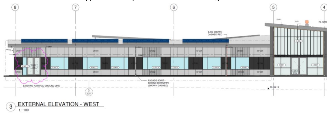
Figure 1 – Extract of elevation of proposed change to bedroom suite WEN-A-043 to replace a window with a double-swinging glazed door – as clouded (NBRS)

These two refinements / changes are shown in Figures 1 to 3 . These design refinements necessitate revision of the approved stamped architectural drawing set.